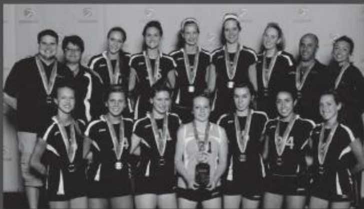
2011 Junior Olympic Medalists